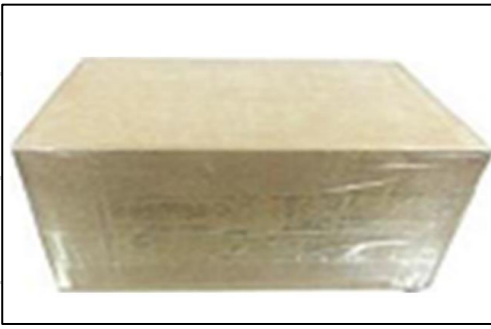
Pic No. 2