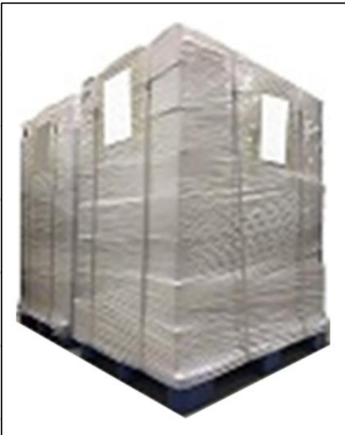
Pic No. 4

Wrapped with yellow tape after wrapping black protective film